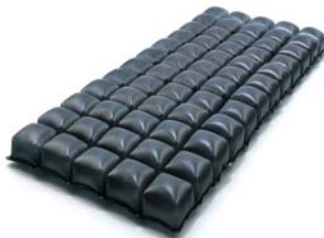
Group I Prodigy Mattress Overlay HCPCS: E0197