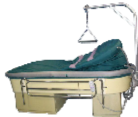
Group III Air Fluidized Therapy Bed HCPCS: E0194