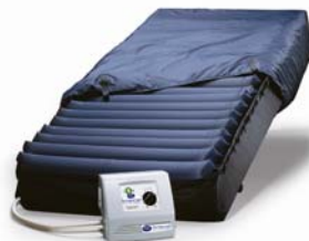
Group II AME 500 Mattress Replacement HCPCS: E0277