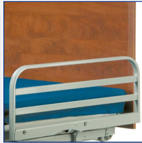
1/2 length head end side rails