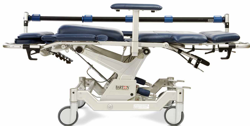
I-700 with Positioning Transfer System (PTS™)